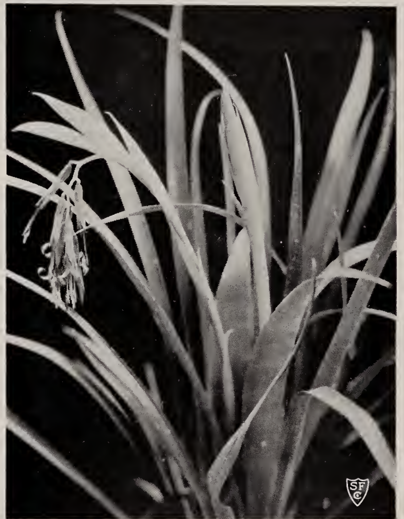
TROPIC TASSEL PLANT. A curious textured foliage very tough, woody, yet graceful and lasting; will be one of the most satisfactory house plants of the future as it thrives as readily as the Sansevieria but is far more charming and durable. Flowers during midwinter, throwing up a drooping spike clothed in carmine colored foliage out of which cascades a cluster of small flowers combining violet blue with green and yellow in striking color effect. Startling to say the least, and so easily grown in every home where these plants with ordinary care may last for years. One of the finest house plants introduced by us during over 30 years in Portland. Fine specimens from $1.50 to $2.50 each , according to size of plant. This plant is native of tropical regions and thrives in the warm dry air of modern homes. (Limited stock only; early orders advisable.)